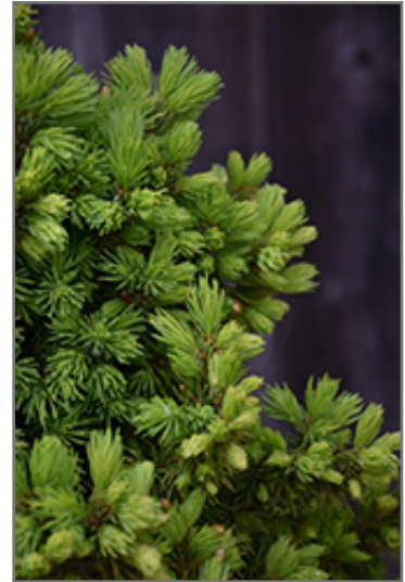
Rainbow's End Spruce foliage

This shrub should only be grown in full sunlight. It prefers to grow in average to moist conditions, and shouldn't be allowed to dry out. It is not particular as to soil type or pH. It is somewhat tolerant of urban pollution, and will benefit from being planted in a relatively sheltered location. This is a selection of a native North American species.