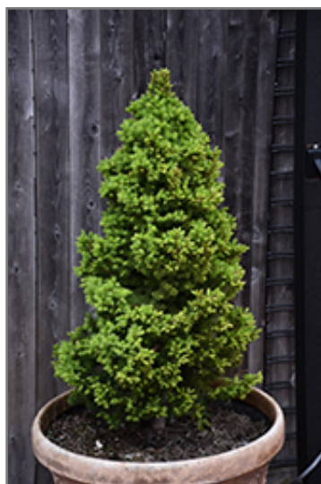
Rainbow's End Spruce