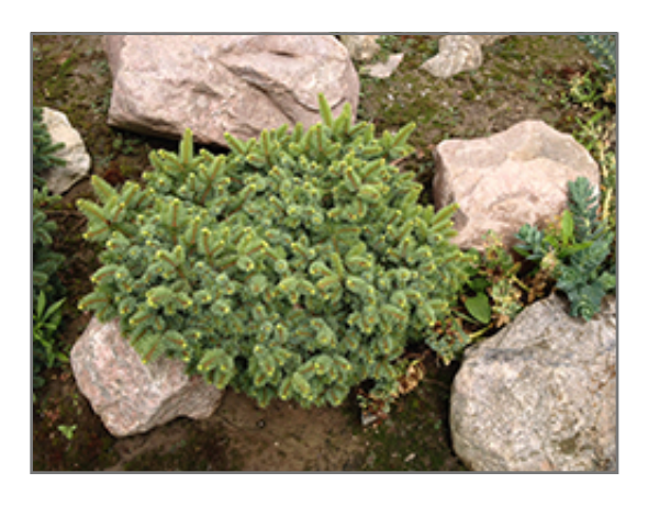
Mrs. Cesarini Blue Spruce

This is a relatively low maintenance shrub. When pruning is necessary, it is recommended to only trim back the new growth of the current season, other than to remove any dieback. Deer don't particularly care for this plant and will usually leave it alone in favor of tastier treats. It has no significant negative characteristics.