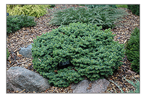
Mrs. Cesarini Blue Spruce

Mrs. Cesarini Blue Spruce is a dense multi-stemmed evergreen shrub with a mounded form. Its relatively fine texture sets it apart from other landscape plants with less refined foliage.