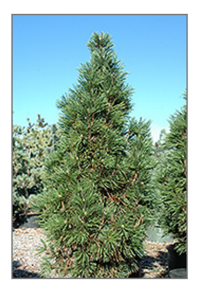
Columnar Mugo Pine