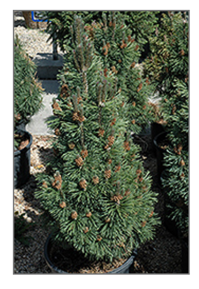
Columnar Mugo Pine

This shrub should only be grown in full sunlight. It prefers dry to average moisture levels with very well-drained soil, and will often die in standing water. It is considered to be drought-tolerant, and thus makes an ideal choice for xeriscaping or the moisture-conserving landscape. It is not particular as to soil type or pH, and is able to handle environmental salt. It is highly tolerant of urban pollution and will even thrive in inner city environments. This is a selected variety of a species not originally from North America.