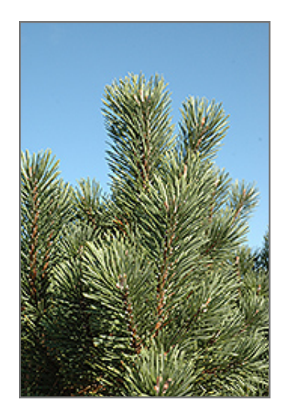
Columnar Mugo Pine foliage