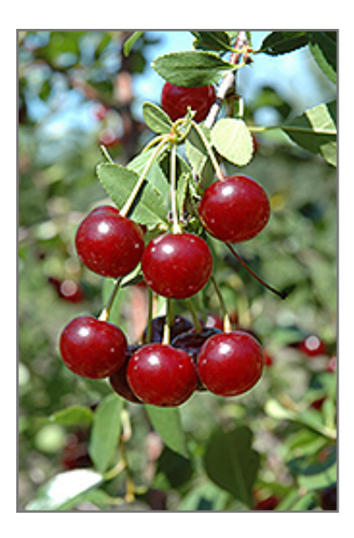
Cupid Cherry fruit

Cupid Cherry features showy clusters of fragrant white flowers along the branches in mid spring. It has green deciduous foliage. The glossy oval leaves turn yellow in fall. The fruits are showy dark red drupes with black overtones, which are carried in abundance from mid to late summer.