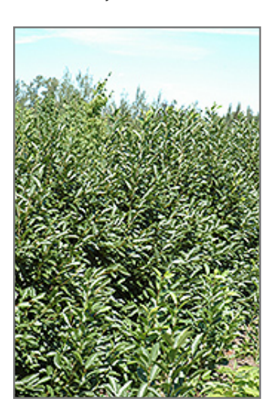
Cupid Cherry