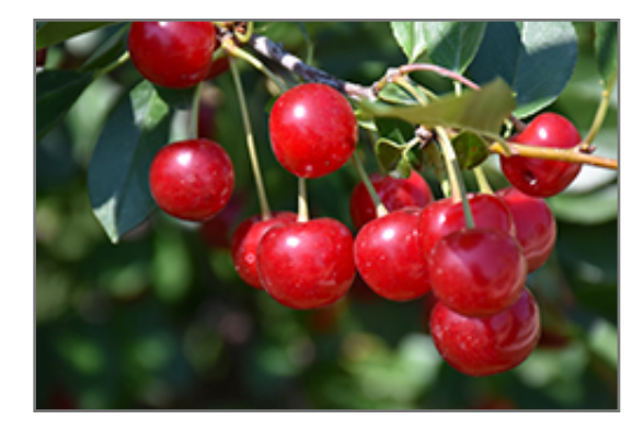
Valentine Cherry fruit

Valentine Cherry features showy clusters of fragrant white flowers along the branches in mid spring. It has green deciduous foliage. The glossy oval leaves turn yellow in fall. The fruits are showy cherry red drupes carried in abundance in late summer. The fruit can be messy if allowed to drop on the lawn or walkways, and may require occasional clean-up.