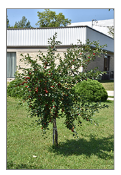
Valentine Cherry fruit