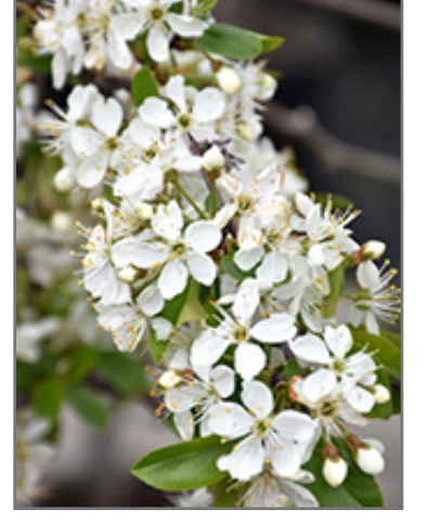
Valentine Cherry flowers

Valentine Cherry will grow to be about 8 feet tall at maturity, with a spread of 5 feet. It has a low canopy, and is suitable for planting under power lines. It grows at a medium rate, and under ideal conditions can be expected to live for 40 years or more. This is a self-pollinating variety, so it doesn't require a second plant nearby to set fruit.