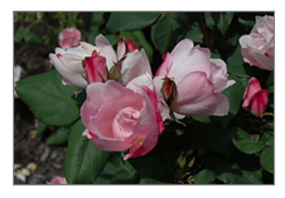
Blushing Knock Out Rose flowers