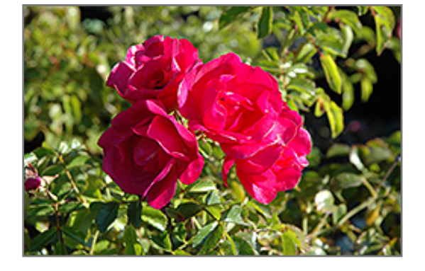
Flower Carpet Pink Rose flowers