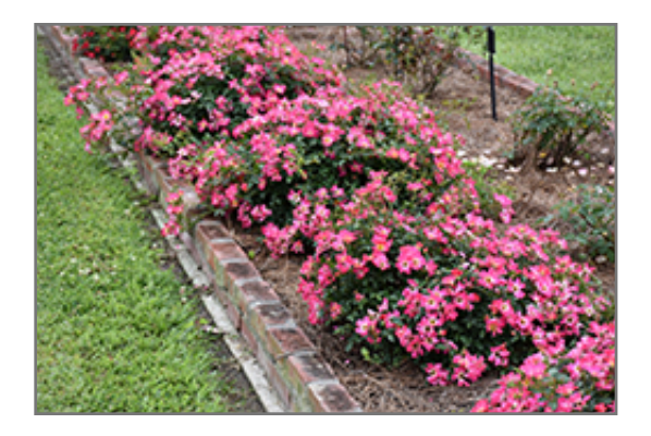
Pink Drift Rose in bloom