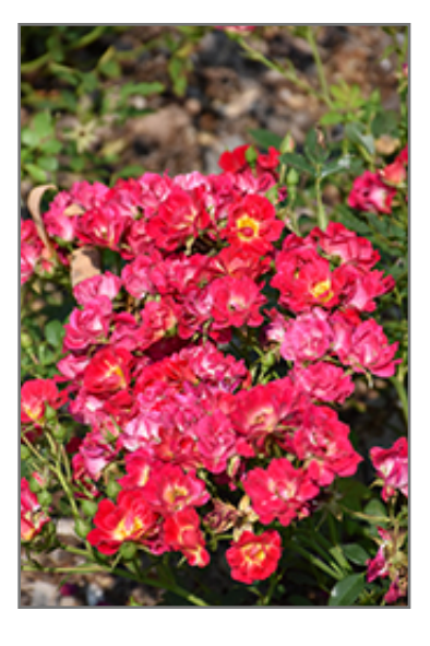
Pink Drift Rose flowers