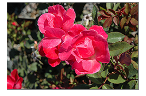
Pink Knock Out Rose flowers