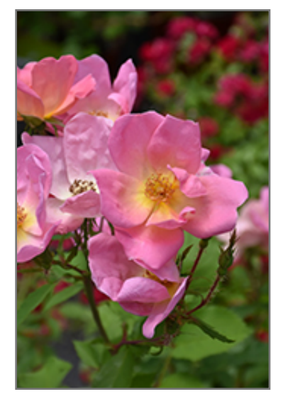
Rainbow Knock Out Rose flowers

Rainbow Knock Out Rose is a multi-stemmed deciduous shrub with an upright spreading habit of growth. Its average texture blends into the landscape, but can be balanced by one or two finer or coarser trees or shrubs for an effective composition.