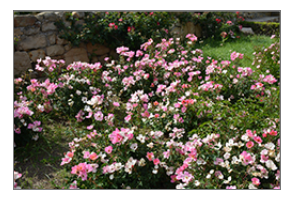
Rainbow Knock Out Rose in bloom

This is a high maintenance shrub that will require regular care and upkeep, and is best pruned in late winter once the threat of extreme cold has passed. Gardeners should be aware of the following characteristic(s) that may warrant special consideration;