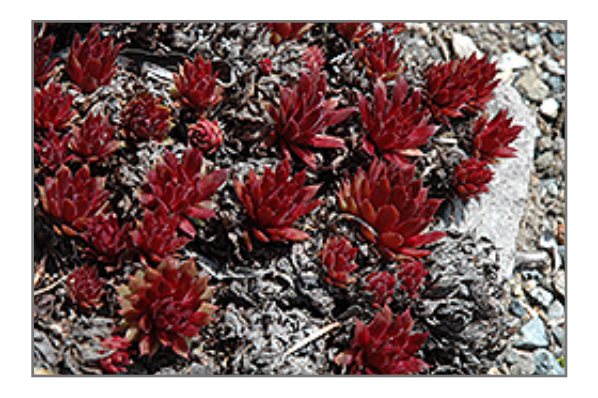
Royal Ruby Hens And Chicks

Royal Ruby Hens And Chicks is recommended for the following landscape applications;