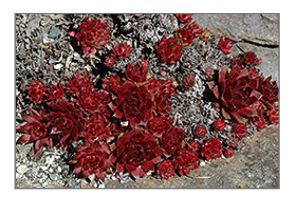
Robin Hens And Chicks