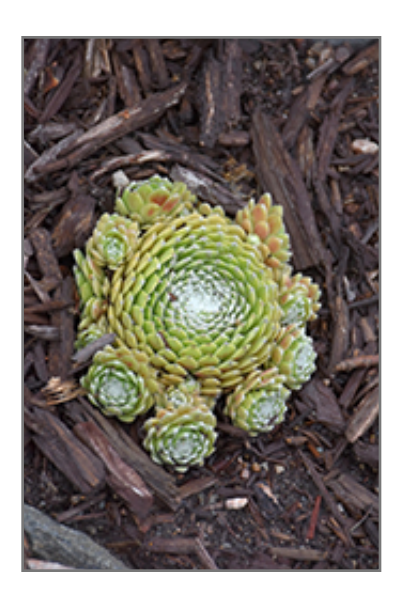
Robin Hens And Chicks

This plant will require occasional maintenance and upkeep, and should not require much pruning, except when necessary, such as to remove dieback. Deer don't particularly care for this plant and will usually leave it alone in favor of tastier treats. Gardeners should be aware of the following characteristic(s) that may warrant special consideration;