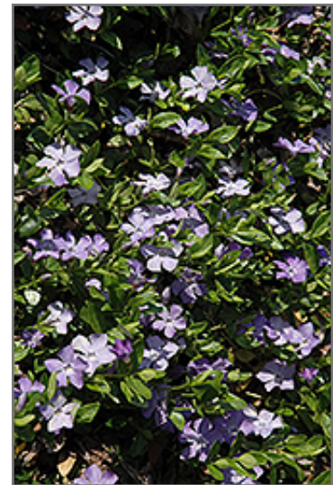
Common Periwinkle in bloom