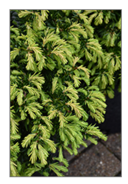
Everlow Yew foliage