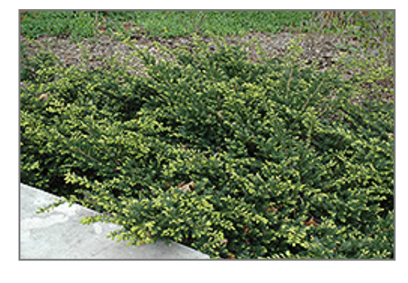
Everlow Yew

A distinctive and versitile evergreen shrub with striking dark green dense foliage; this is a low growing spreader, resistant to wind burn; low maintenance and takes pruning very well