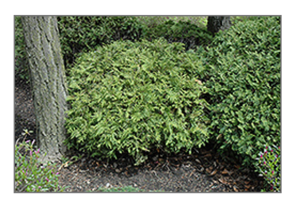
Dwarf Western Arborvitae

A real gem of an evergreen shrub, forming a compact egg-shaped mound; features bright golden foliage held over dark green all season, ideal for use as a colorful detail accent in the shrub or rock garden; performs best in moist, humid locations