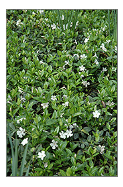
White Periwinkle in bloom