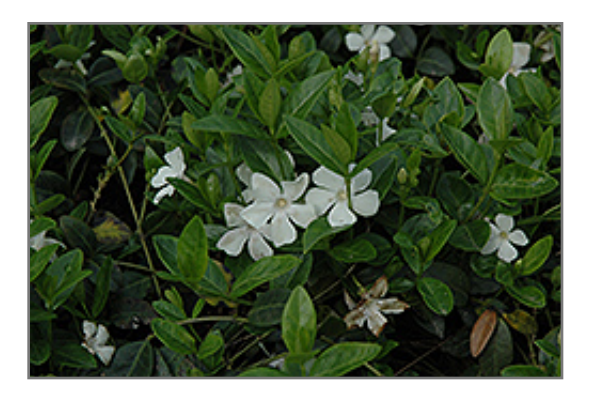
White Periwinkle flowers