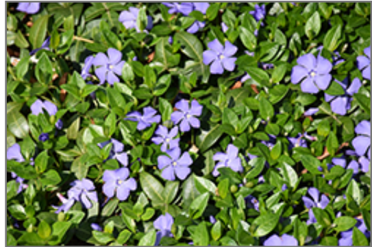
Dart's Blue Periwinkle flowers