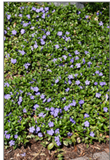
Dart's Blue Periwinkle in bloom