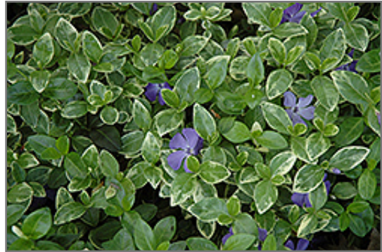
Sterling Silver Periwinkle flowers