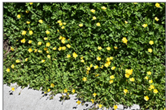
Barren Strawberry in bloom