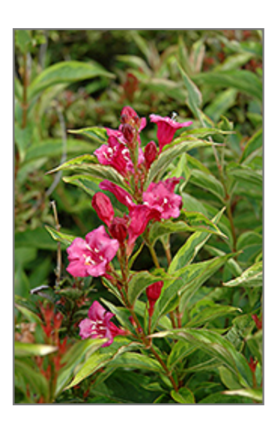
French Lace Weigela flowers