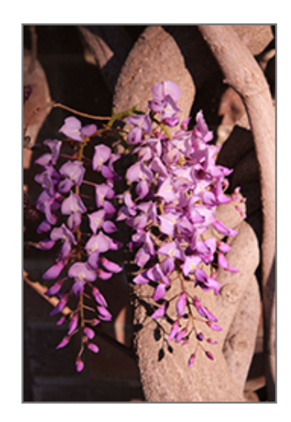
Pink Japanese Wisteria flowers