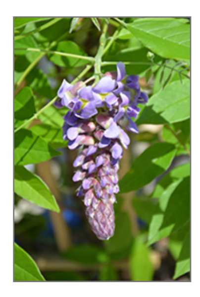
Amethyst Falls Wisteria flower buds