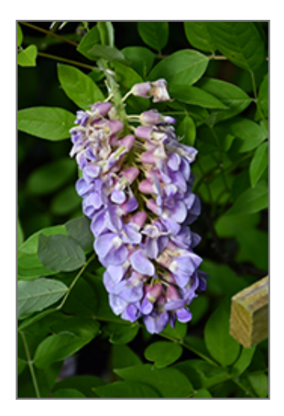
Amethyst Falls Wisteria flowers

Amethyst Falls Wisteria is a multi-stemmed deciduous woody vine with a twining and trailing habit of growth. Its average texture blends into the landscape, but can be balanced by one or two finer or coarser trees or shrubs for an effective composition.