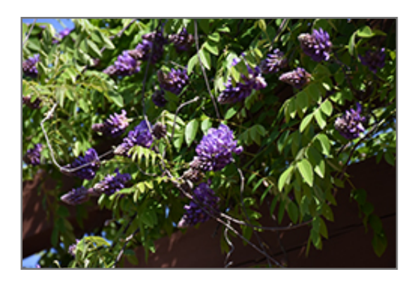
Blue Moon Wisteria flowers