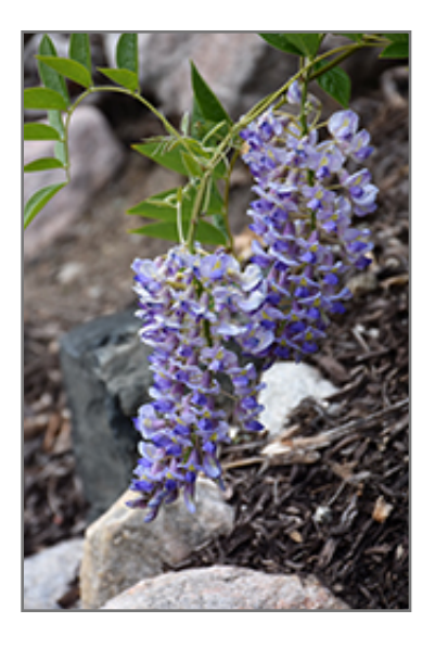
Blue Moon Wisteria flowers

This is a high maintenance woody vine that will require regular care and upkeep, and should only be pruned after flowering to avoid removing any of the current season's flowers. It is a good choice for attracting hummingbirds to your yard, but is not particularly attractive to deer who tend to leave it alone in favor of tastier treats. Gardeners should be aware of the following characteristic(s) that may warrant special consideration;