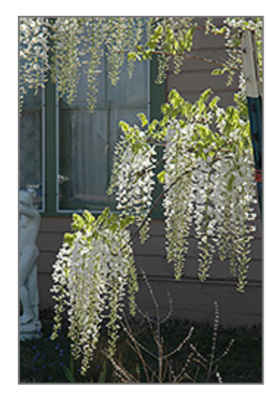
White Chinese Wisteria flowers