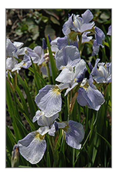
Summer Sky Iris flowers

Pretty light-blue to white flowers marked with yellow centers; blooms emerge from lush, sword-like foliage; hardy and easy to grow; cut back in the fall to reduce pests