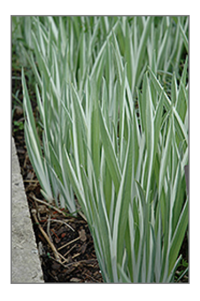
Variegated Japanese Flag Iris

Variegated Japanese Flag Iris is recommended for the following landscape applications;