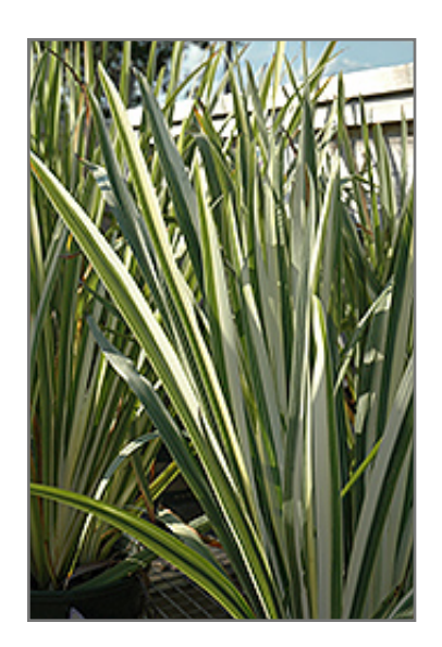
Variegated Japanese Flag Iris foliage