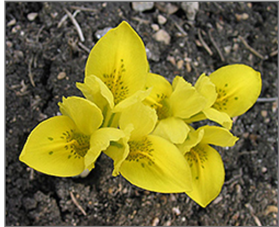
Dwarf Iris flowers

Cheerful bright yellow blooms with curious brown spots; flowers emerge from lush, sword-like foliage; sporadic blooming in subsequent years as bulblets need to mature; hardy and easy to grow; cut back in the fall to reduce pests