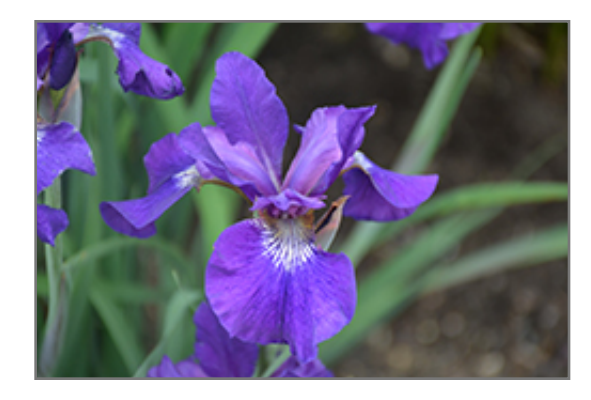
Ruffled Velvet Iris flowers