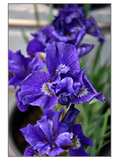
Ruffled Velvet Iris flowers