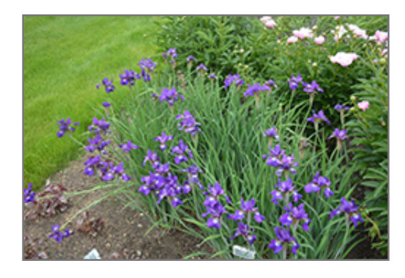
Ruffled Velvet Iris in bloom

This plant does best in full sun to partial shade. It is quite adaptable, prefering to grow in average to wet conditions, and will even tolerate some standing water. It is not particular as to soil type or pH. It is somewhat tolerant of urban pollution. This is a selected variety of a species not originally from North America. It can be propagated by division; however, as a cultivated variety, be aware that it may be subject to certain restrictions or prohibitions on propagation.