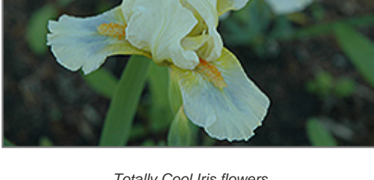
Totally Cool Iris flowers