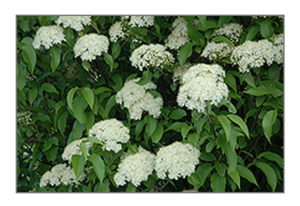
Nannyberry flowers