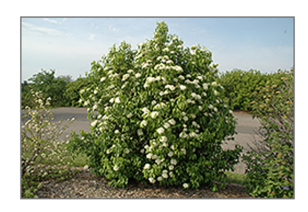
Nannyberry in bloom

Nannyberry is a multi-stemmed deciduous shrub with an upright spreading habit of growth. Its average texture blends into the landscape, but can be balanced by one or two finer or coarser trees or shrubs for an effective composition.