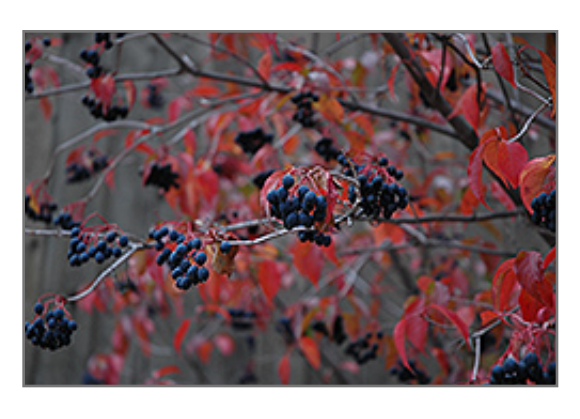
Nannyberry fruit