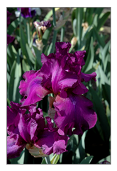
Sultry Mood Iris flowers

Sultry Mood Iris features bold purple flag-like flowers with blue falls at the ends of the stems in late spring. The flowers are excellent for cutting. Its large sword-like leaves remain green in colour throughout the season.