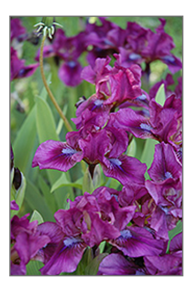
Raspberry Jam Iris flowers

Raspberry Jam Iris features showy violet flag-like flowers with burgundy throats and purple falls at the ends of the stems in late spring. The flowers are excellent for cutting. Its small sword-like leaves remain green in colour throughout the season.