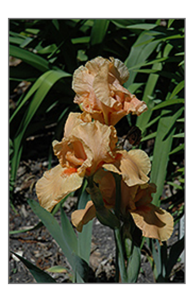
Mary Mahalos Iris flowers

Mary Mahalos Iris features bold peach flag-like flowers with a orange beard at the ends of the stems in late spring. The flowers are excellent for cutting. Its sword-like leaves remain green in colour throughout the season.