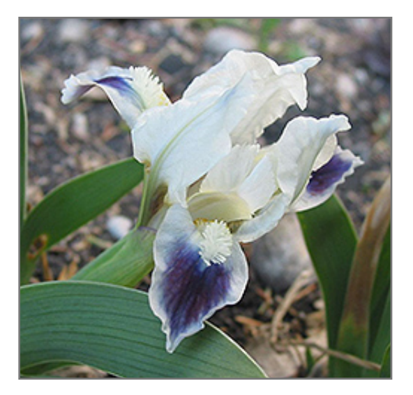
Little Drummer Boy Iris flowers

Little Drummer Boy Iris features bold white flag-like flowers with yellow throats and navy blue falls at the ends of the stems in mid spring. The flowers are excellent for cutting. Its small sword-like leaves remain green in colour throughout the season.