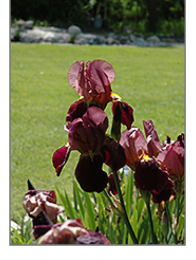
Indian Chiefr Iris flowers

Indian Chiefr Iris features bold burgundy flag-like flowers with yellow throats and a gold beard at the ends of the stems in late spring. The flowers are excellent for cutting. Its sword-like leaves remain green in colour throughout the season.