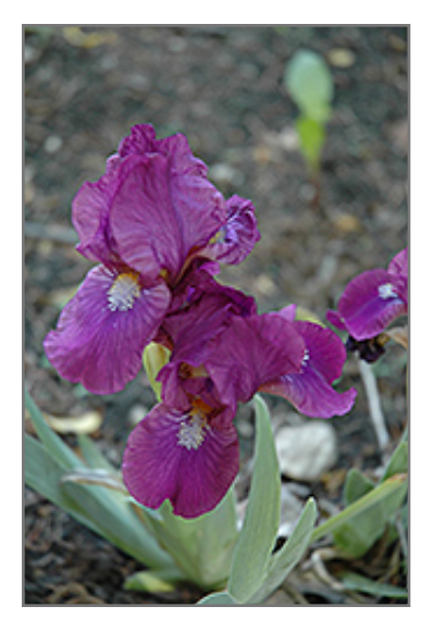
Heather Carpet Iris flowers

Heather Carpet Iris features bold purple flag-like flowers with a yellow beard at the ends of the stems in late spring. The flowers are excellent for cutting. Its small sword-like leaves remain green in colour throughout the season.