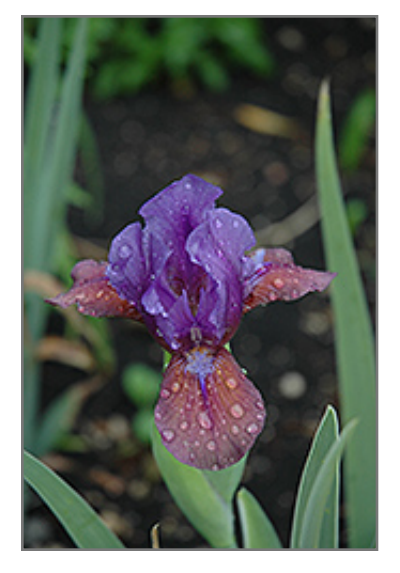
Grape Cordial Iris flowers

Grape Cordial Iris features bold blue flag-like flowers with purple overtones and coppery-bronze falls at the ends of the stems in late spring. The flowers are excellent for cutting. Its sword-like leaves remain green in colour throughout the season.