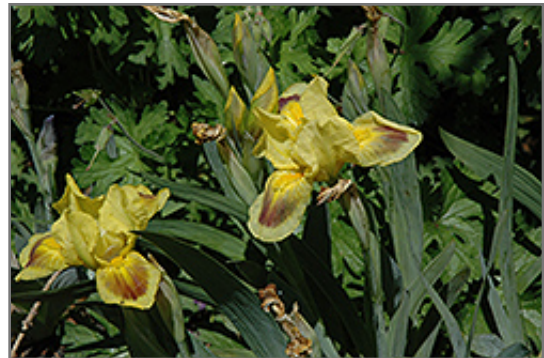
Curio Iris flowers

Group/Class: Miniature Dwarf Bearded Iris