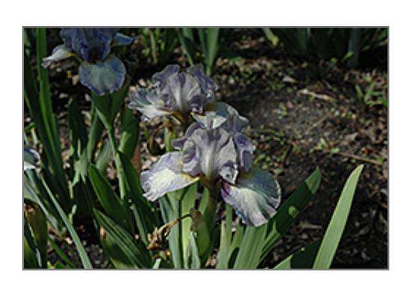
Chubby Cheeks Iris flowers

Group/Class: Standard Dwarf Bearded Iris