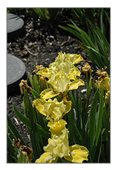
Bonus Baby Iris flowers

Bonus Baby Iris features showy yellow flag-like flowers with a white beard at the ends of the stems in late spring. The flowers are excellent for cutting. Its sword-like leaves remain green in colour throughout the season.