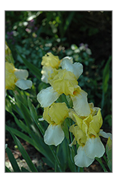
Blessed Again Iris flowers

Blessed Again Iris features showy yellow flag-like flowers with white falls at the ends of the stems in mid spring. The flowers are excellent for cutting. Its sword-like leaves remain green in colour throughout the season.