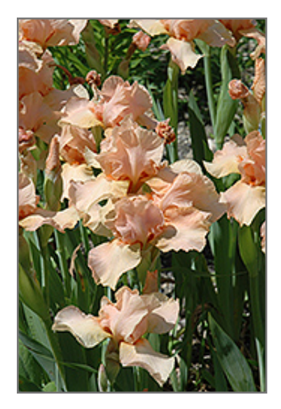
Ask Alma Iris flowers

Ask Alma Iris features showy peach flag-like flowers with a pink beard at the ends of the stems in late spring. The flowers are excellent for cutting. Its sword-like leaves remain green in colour throughout the season.