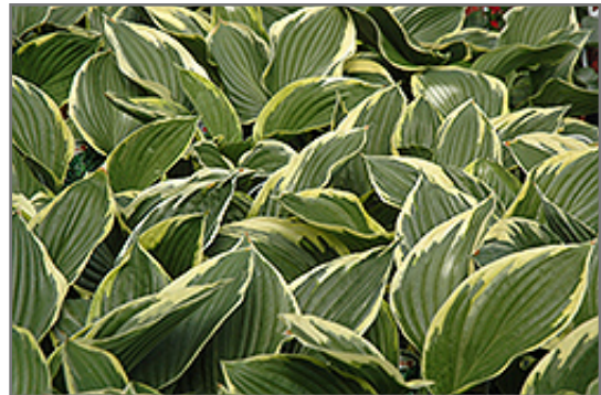
Golden Variegated Hosta foliage