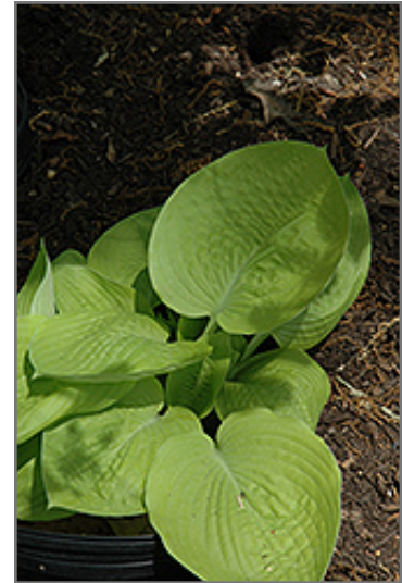
Zounds Hosta foliage