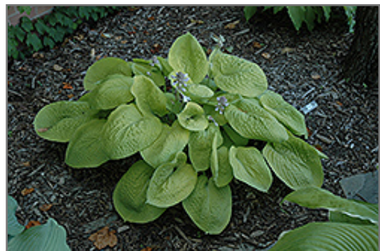
Zounds Hosta in bloom