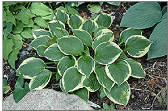
Winsome Hosta