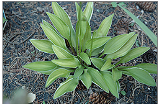
Little White Lines Hosta