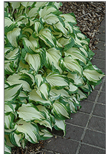
White Christmas Hosta foliage