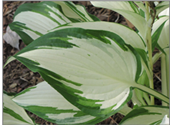
White Christmas Hosta foliage