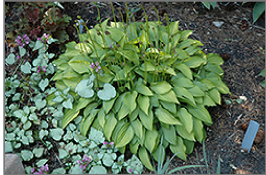
Twist Of Lime Hosta