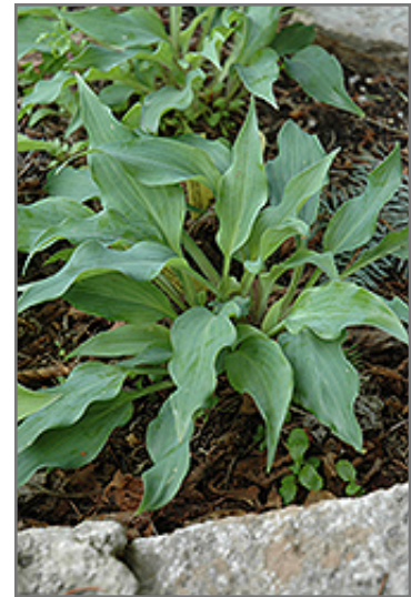
Twilight Time Hosta

Lance-shaped leaves are sea-green with attractive rippled appearance; provides beautiful texture and contrast to other plants; lavender spikes of flowers in mid to late summer