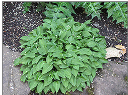
Tiny Tears Hosta