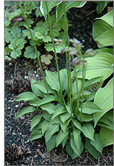
Tiny Tears Hosta

Tiny Tears Hosta is recommended for the following landscape applications;